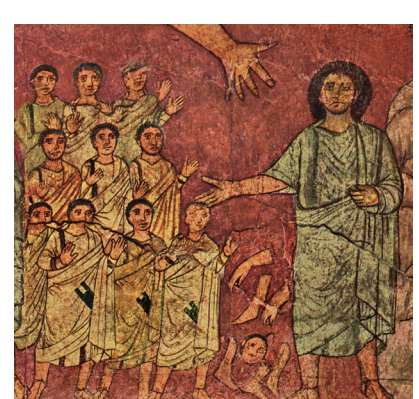
Figure 4. The Exaltation of Resurrected Israel, Dura Europos Synagogue, ca. 250.

Although there is little indication in the Old Testament that Israelite kingship rituals were given to anyone besides the monarch, there is significant nonscriptural evidence from later times that analogous rites were made available to others. For example, findings at Qumran and Dura Europos suggest that, in at least some strands of Jewish tradition, priesthood rituals were seen as enabling members of the community, not just its ruler, to participate in a form of worship that brought them into the presence of God ritually.<sup>56</sup> A hint of this tradition is evident in the account of