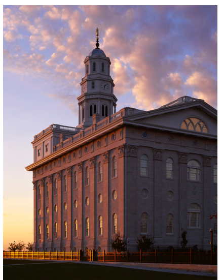
Figure 2. Nauvoo Temple.

In addition, the rituals of the Lodge enabled Mormon Masons to become familiar with symbols and forms they would later encounter in the Nauvoo temple. These included specific ritual terms, language, handclasps, and gestures as well as larger patterns such as those involving repetition and the use of questions and answers as an aid to teaching. Joseph Smith's own exposure to Masonry no doubt led him to seek further revelation as he prepared to introduce the divine ordinances of Nauvoo temple worship.